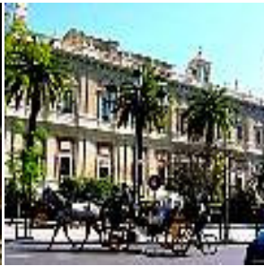
Horse Carriage close to Cathedral