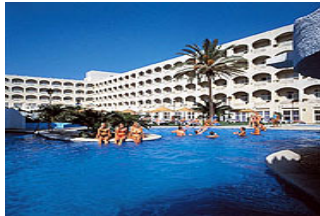
4 Star Hotel