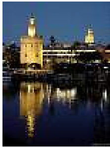
Torre del Oro Sevilla

Dinner and Lodging in 4* Hotel Sevilla Center or similar.