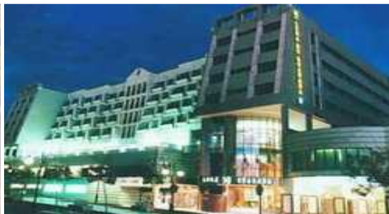
Gran Hotel Luna in Granada