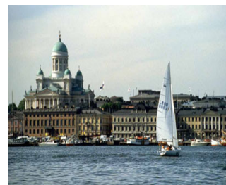
Helsinki from the Sea