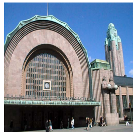
Central Train Station