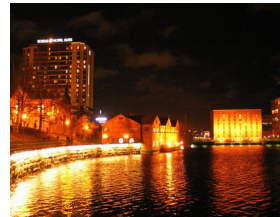
Tampere at Night