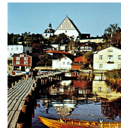
River of Porvoo