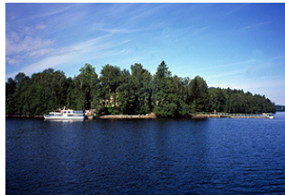
Lake in Tampere