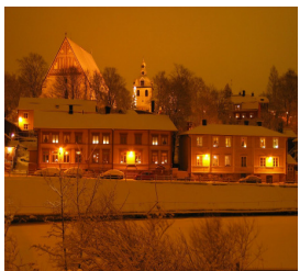
Porvoo in Winter

Porvoo is an attractive tourist destination and the importance of tourism is considerable both for the retail trade and the service sector. The Old Town provides one of its most colourful sights and tourist attractions. Old Porvoo is famous for its narrow lanes and brick-coloured riverside warehouses. In the Empire-style part of the town, the low wooden houses belong to the classical town plan where the streets form squares. It is here that the home of Finland's greatest poet, Johan Ludvig Runeberg, provides one of Porvoo's most popular tourist attractions.