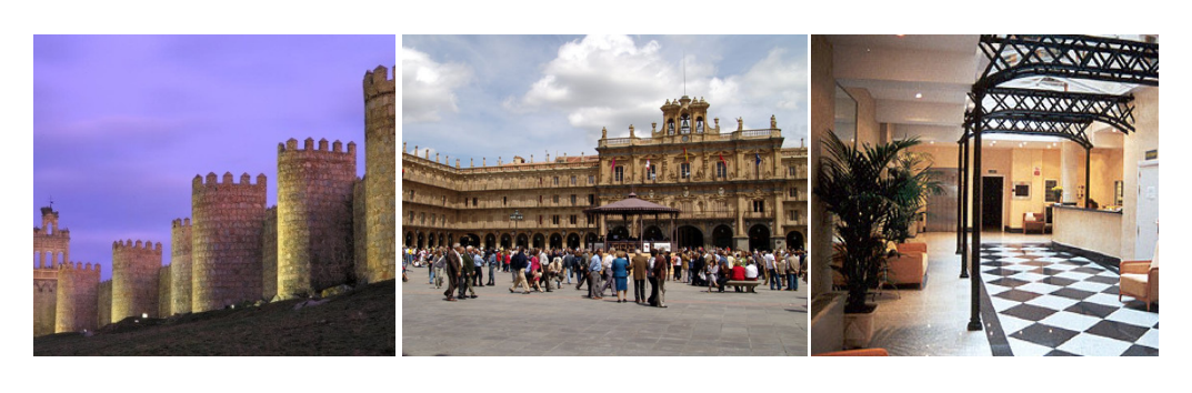
Avila, the wall