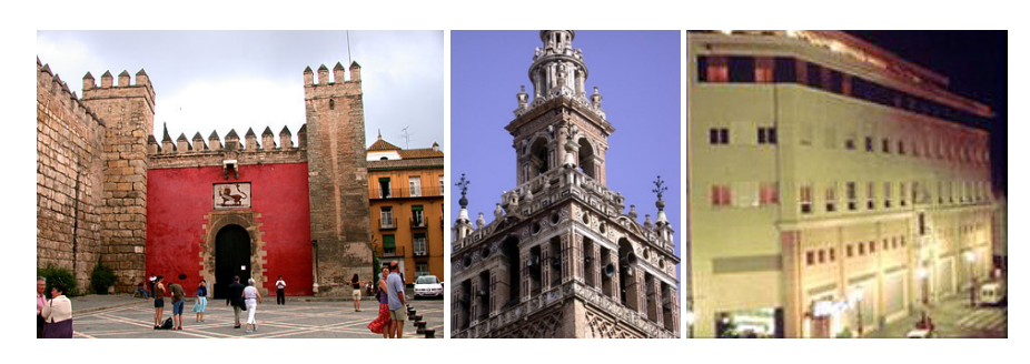
Alcazar in Sevilla