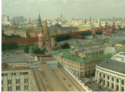
Kremlin tour (territory + 3 cathedrals) Alexandrinskiy garden, maneznaya square Free lunch at the Futuristic Shopping Center "Ohotniy Riad"