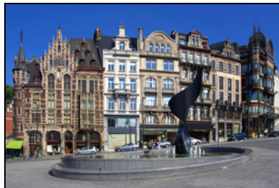
Brussels Grand Place

Here, we are also at the very heart of the European Union: we drive in front of the imposing EU buildings housing the European Commission, the European Parliament and the Council of Ministers.