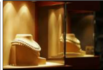
Diamond Factory - Amsterdam

After the tour we're driving on to the Hague where we have a short city tour. The Hague is a very important city in the Netherlands, because it's the governmental city and also the city where the queen lives. Binnenhof - the oldest parts of this medieval count's castle, the Ridderzaal (Knight's Hall) and the Rolgebouw (Roll Building), situated at the rear, date from the 13th century. In the centuries that followed alteration work has been carried out and extensions have been added to the Binnenhof. This complex housed the local government as early as the 15th century. Noordeinde Palace has always been the residence of the reigning Stadtholder or monarch. The first inhabitant was Louise de Coligny, the last wife of William the Silent. In the 17th century, Frederik Hendrik and Amalia van Solms had the Huis ten Bosch Palace built.