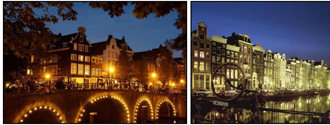
Amsterdam by night

Having seen Holland in miniature we're heading back to Amsterdam for dinner and overnight. After dinner you can take a walk and see Amsterdam by night.