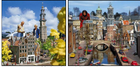
Madurodam miniature city

Amsterdam, the Alkmaar cheese market and parts of the Delta Works, all replicated in minute detail on a 1:25 scale. All is set in beautiful gardens. Windmills turn, ships sail through the harbour and trains are traversing the city on the world's largest miniature railway.