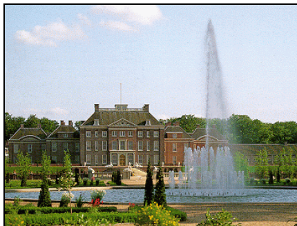
Het Loo Palace

From de palace we are going back to Amsterdam for the dinner and overnight.